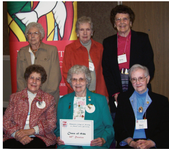
Class of 1946 - 60th Reunion