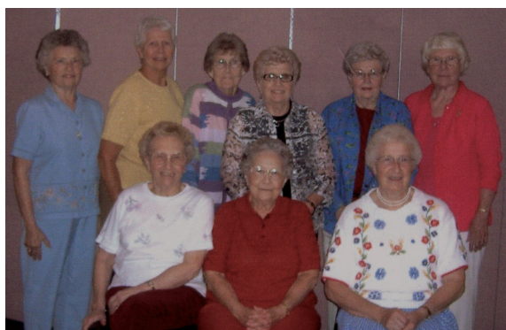
Class of 1948 Reunion