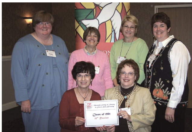
Class of 1981 - 25th Reunion