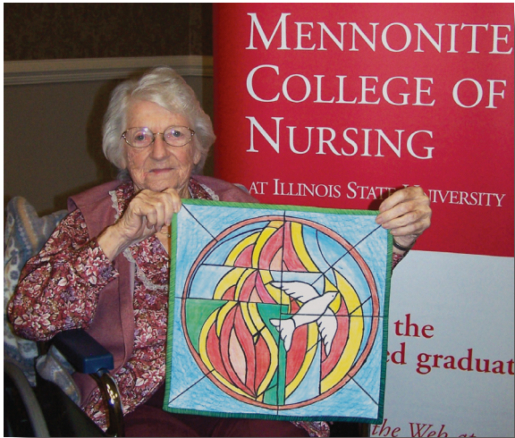
Class of 1936 - 70th Reunion