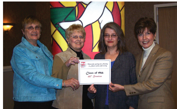
Class of 1966 - 40th Reunion