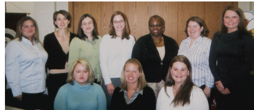
2007 Accelerated cohort

In January of 2007, the first cohort of the Accelerated B.S.N. Sequence started the nursing program. Their schedule will consist of 4 rigorous 12-week sessions and they will complete the program in December of 2007.