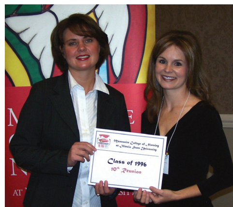
Class of 1996 - 10th Reunion