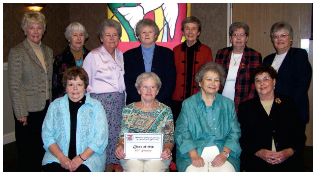
Class of 1956 - 50th Reunion