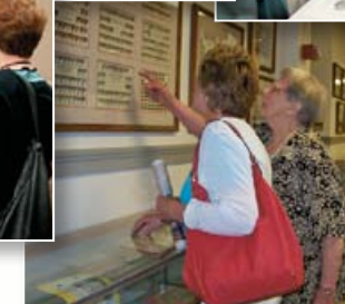
Above, Edwards Hall Tours