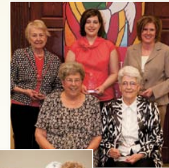
Left, 2010 Award Recipients

If you would like to contact an MNAO board member, please call Mennonite College of Nursing at (309) 438-2174.