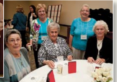
Above, Alumni Luncheon