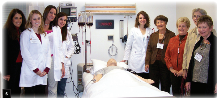
1) Alumni Breakfast Buffet; 2) Class of 1957 - 50th Reunion; 3) Class of 1967 - 40th Reunion; 4) Class of 1982 - 25th Reunion; 5) Class of 1997 - 10th Reunion; 6) Building/lab tour at Edwards Hall