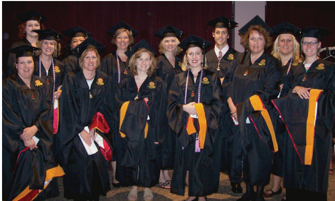
2007 graduate students

The school nurse at the elementary schools worked with Mennonite College of Nursing to set up this service for the families, because the children would not have been able to attend school without having a physical exam.