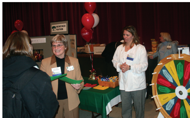
Heritage Enterprises "Wheel of Knowledge" at the LTC Career Fair