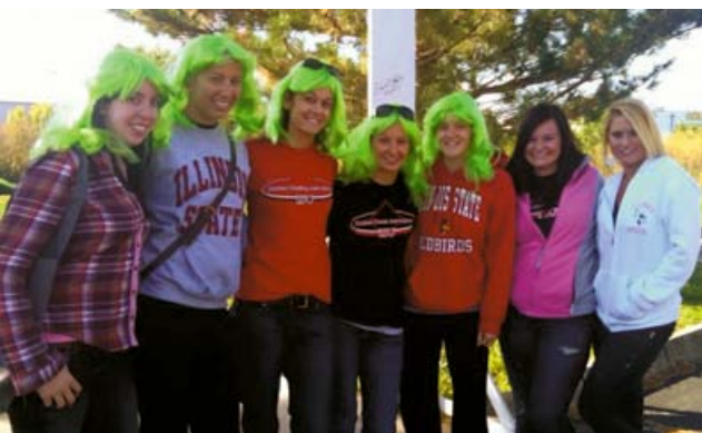
MCN students at Heart Walk

As the demand for B.S.N. nurses continues, MCN will continue to provide quality education, experiences and service to undergraduate students.