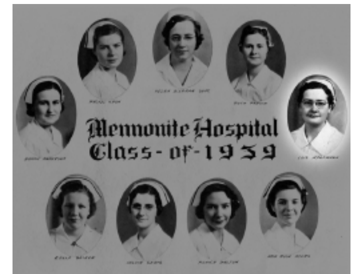
Below, Class of 1939

Non-Profit Org US Postage PAID Illinois State University