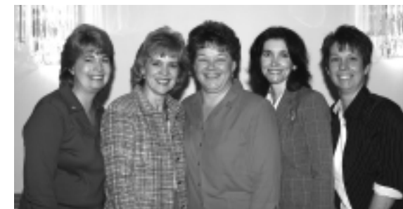
The Class of 1979 celebrating their 25th reunion