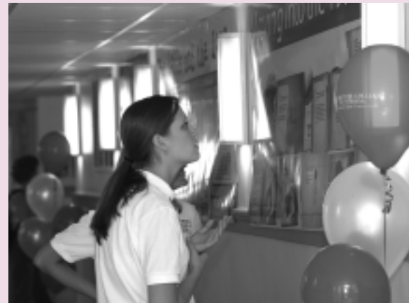
Current nursing student views the historical timeline