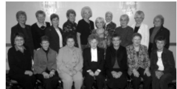
The Class of 1954 celebrating their 50th reunion