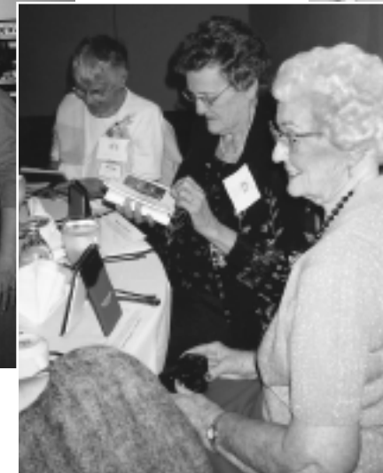
The Class of 1944 celebrating their 60th reunion