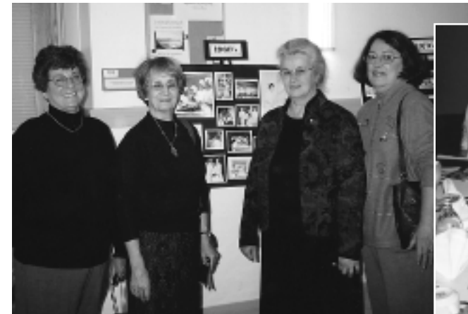
The Class of 1964 celebrates their 40th reunion