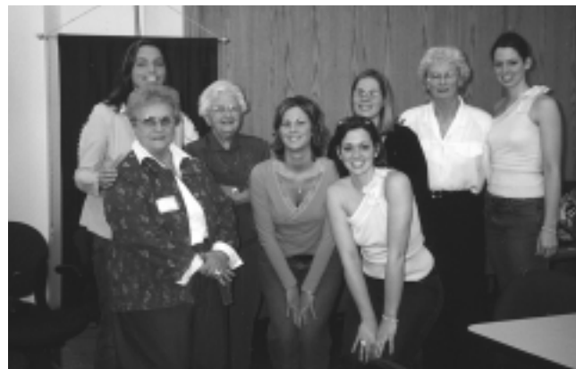
Alumni celebrate Nurses Week with students, April 27 and 29