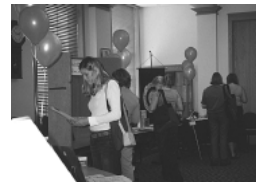
Hartford Open House, August 2003

Mennonite College of Nursing continues to work on its grant project "Creating Innovative Strategies in Nursing Education to Improve Care of the Older Adult." In August of 2003 there was a Hartford Open House,