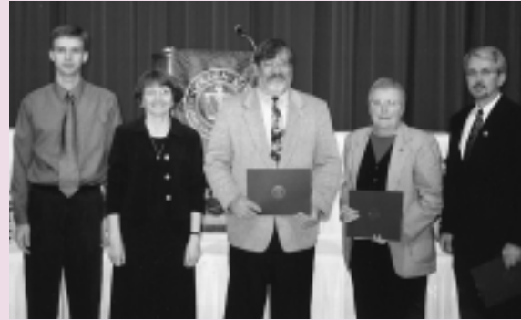
Illinois State inductees

Golden Key has more than 8,000 honorary members, who are elected by local chapters and are active on their campuses or in their communities. Local Golden Key chapters select up to five honorary members annually. Honorary members reflect the qualities and values of the society and are active in areas of scholarship, leadership, or service.