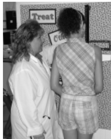
MCN graduate students went to Irving Elementary School on August 15, 2003 to administer physicals to students.