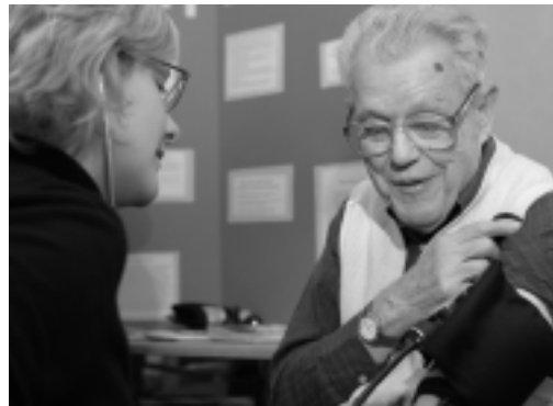
Above, Mennonite students held a health fair for the residents of Heritage's Adelaide Apartments in December.