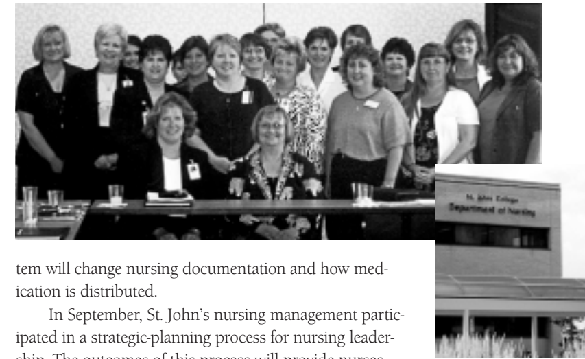
Top: MCN and St. John's faculty and staff. Above: the St. John's facility.

St. John's is planning several projects. One future project will renovate several areas throughout the hospital, including the patient tower, ICU, and inpatient operating rooms. They also will replace their information systems in all 13 of their affiliated hospitals. That new sys-