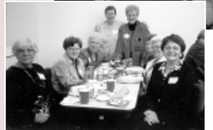
Below, Alumni read The Flame at Mennonite College of Nursing's Homecoming open house. Bottom, members of the Class of 1952.